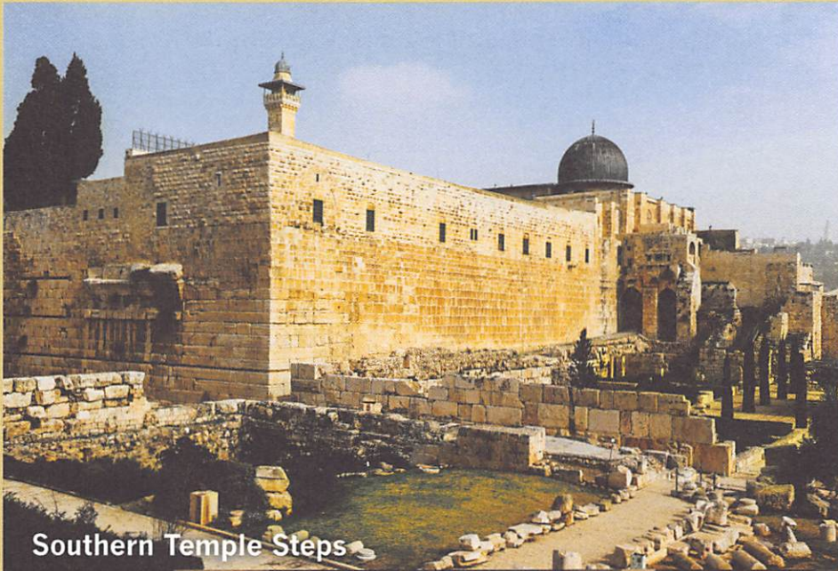
Southern Temple Steps